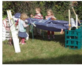
Den building in Whisper's